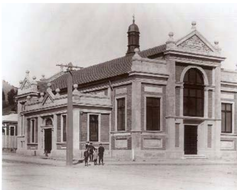
Nelson School of Music c.1901

There is an opportunity to improve coordination and collaboration between heritage owners, heritage agencies, Tangata Whenua, business and the general community. This includes further clarification of agency roles. Resourcing and alignment of heritage goals and actions would better serve heritage management. While Nelson City Council is clearly seen as a lead agency, owner of heritage resources and facilitator, other agencies also have responsibilities and can provide valuable contributions. There is also an opportunity for improving coordination within Council on policies and activities affecting heritage.